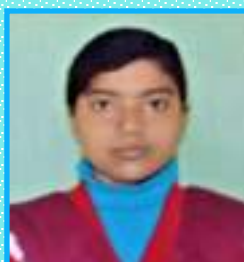
Salge Mardi Hindi